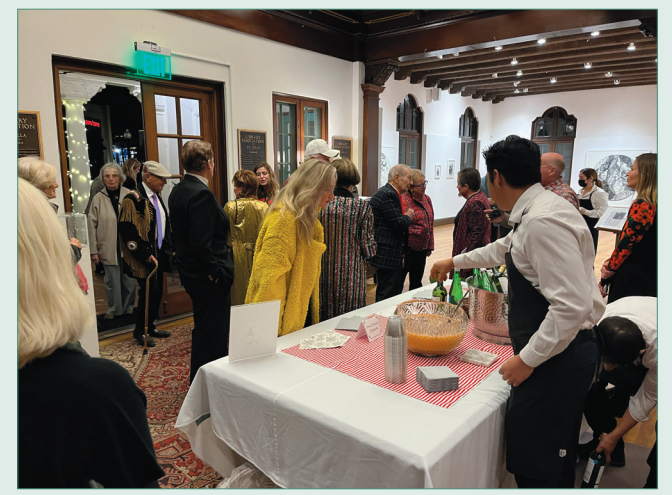
The holiday crowd arrives bundled up and ready for good cheer.