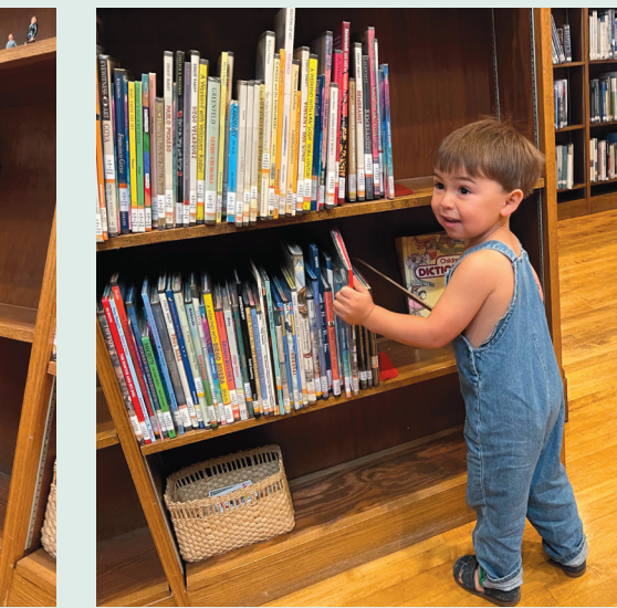
Storytime on Wednesday afternoons is back at the library—as attested by these two cuties perusing the Young People's Collection