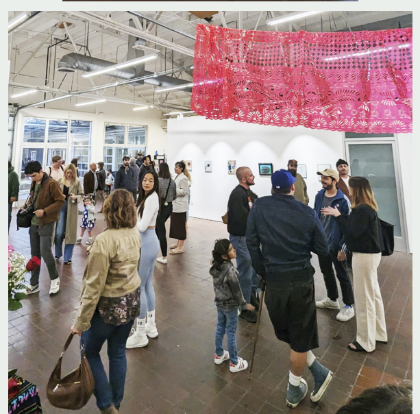
A crowd enjoys the art and festivities to welcome Mother's Day weekend at the Athenaeum Art Center during the Barrio Art Crawl.