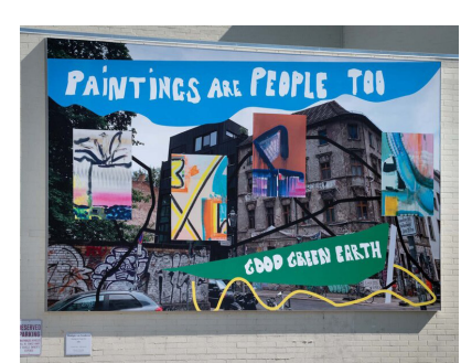
The several paintings in Van Genderen's mural are stand-ins for people.

Tickets are $15 for Athenaeum members, $20 for nonmembers, and $5 for students. For tickets and more details, contact us at 858-454-5872 or ljathenaeum.org/special-lectures.