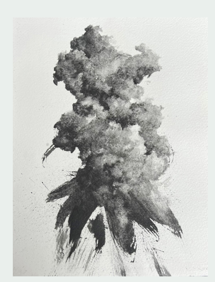
Tatiana Ortiz-Rubio, 1:43pm, 2022 Graphite and water on paper, 10 x 8 inches Athenaeum Purchase, Commissioned for 2023 Patron Gift (30th) Athenaeum Permanent Collection, 2023.04