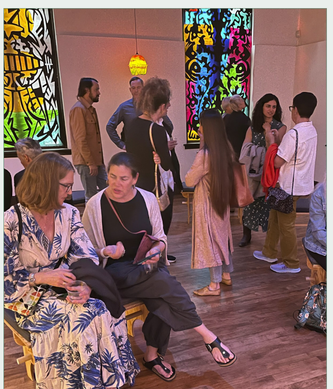
Fans enjoy sitting in the glow of the coruscating windows.

ANNUAL SDSU ART COUNCIL SCHOLARSHIP EXHIBITION OPEN HOUSE AND PRESENTATION, MAY 13, 2023