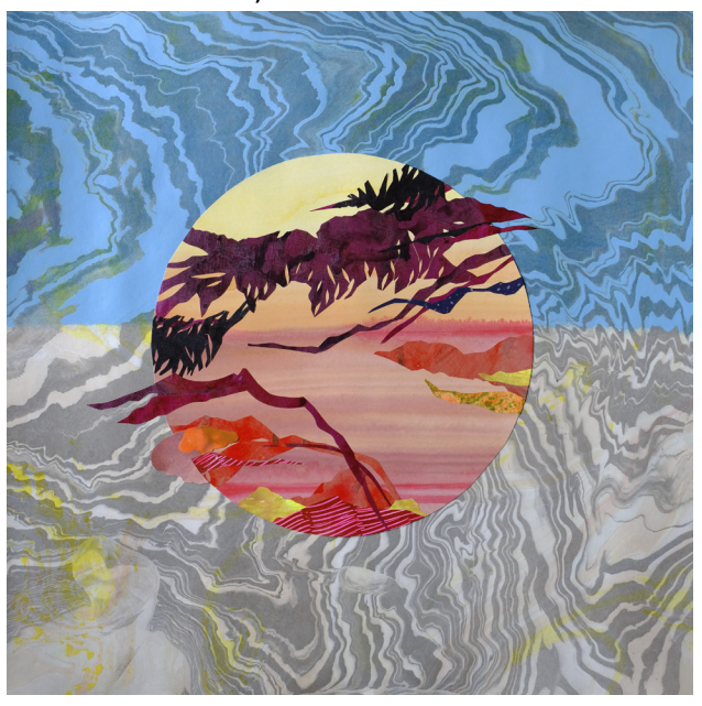
Eva Struble, Fidalgo , 2023 Acrylic, pencil, and collage on paper, 18.75 x 18.75 inches Commissioned for 2023–2024 Music Program Cover (22nd) Athenaeum Permanent Collection, 2023.01

The Athenaeum is pleased to announce the artist for its 2023–2024 concert program cover: Eva Struble. Struble drew a large number of visitors to the Athenaeum to see her colorful and inventive exhibition, Midden , at our library from January 14 through March 4, 2023.