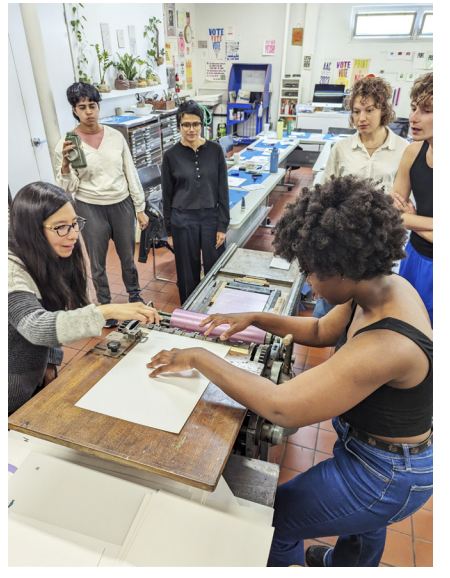
Open Print Studio is open to all ages.

The AAC held two successful art receptions in May, the Mothers' Day pop-up on May 13 and the Faculty Exhibition on May 20. The latter show will be on view through August 5.