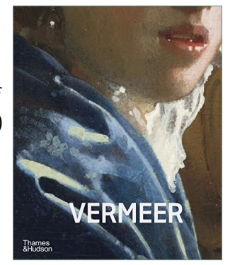
The Vermeer catalog includes more than half of the artist's known works.

quickly, and it recently ended on June 4. However, if you did not have the opportunity to travel and view the show in person, the Athenaeum has added to our collection the definitive Vermeer catalog that