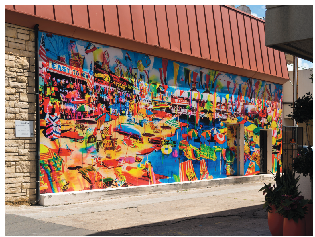
Ocean Front Property in Arizona, Rosson Crow. Sheryl and Bob Scarano, Wall Sponsors.

We are thrilled to announce Ocean Front Property in Arizona , a new mural by Rosson Crow located at 925 Silverado Street, on the alley around the corner from Silverado Cleaners. Crow's mural is a fantastical scene depicting a fictitious beachfront location in the landlocked state of Arizona, a fabricated imagining given the geography of the southwestern state.