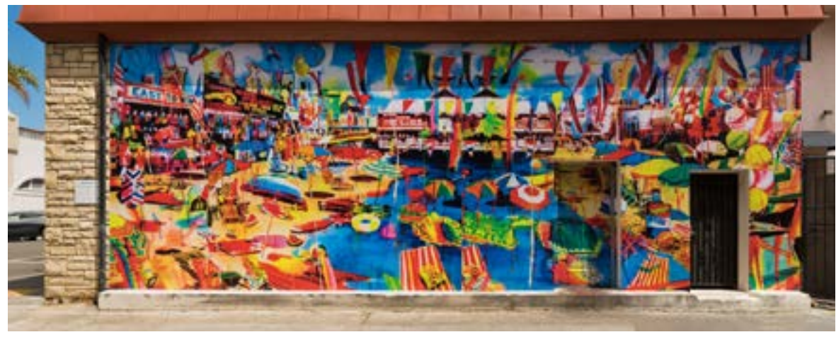
Rosson Crow, Ocean Front Property in Arizona (2022)