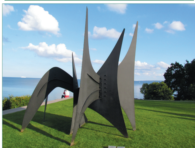
Alexander Calder, Almost Snow Plow from 1964/76