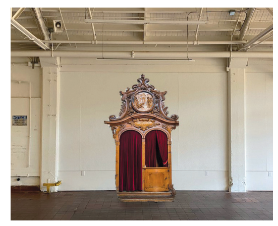
The Sugar Museum show offers a dietary confessional

We are excited to announce Eat, Nevertheless , a Sugar Museum group exhibition connecting themes of Latino and American food, culture, consumerism, and eating, coming to the Main Gallery of the Athenaeum Art Center. The show opens on September 11 with a reception from 5 to 8 p.m. and features multimedia