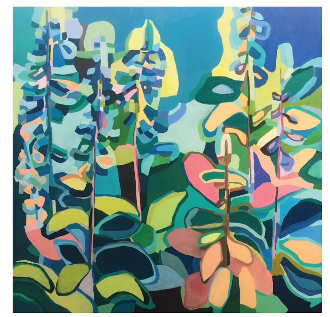
Prudence Horne, Foxgloves, 2020. Oil on canvas

We are currently using our 19th cover, honoring Prudence Horne, who exhibited in our Rotunda Gallery in 2020 and is represented in our permanent collection. She was initially chosen for the 2020-2021 program cover, but we were unable to use paper programs during the pandemic.