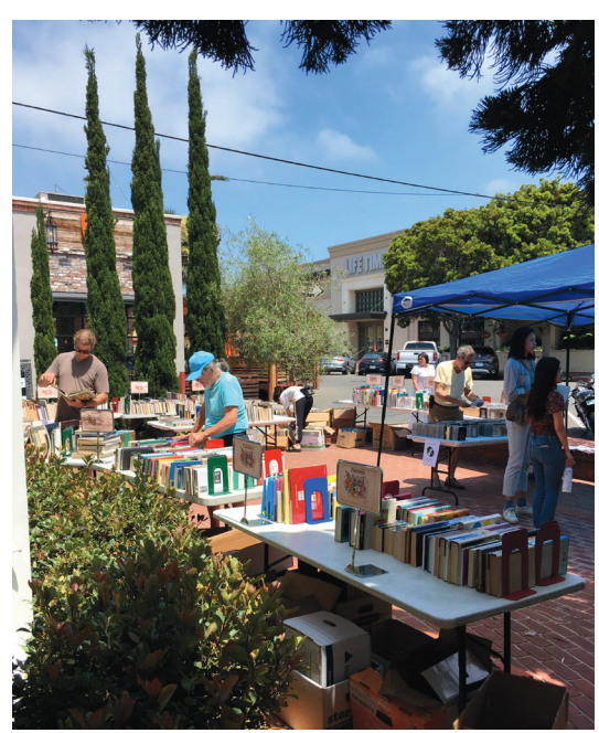
Don't miss our quarterly book sale on Saturday, September 18!