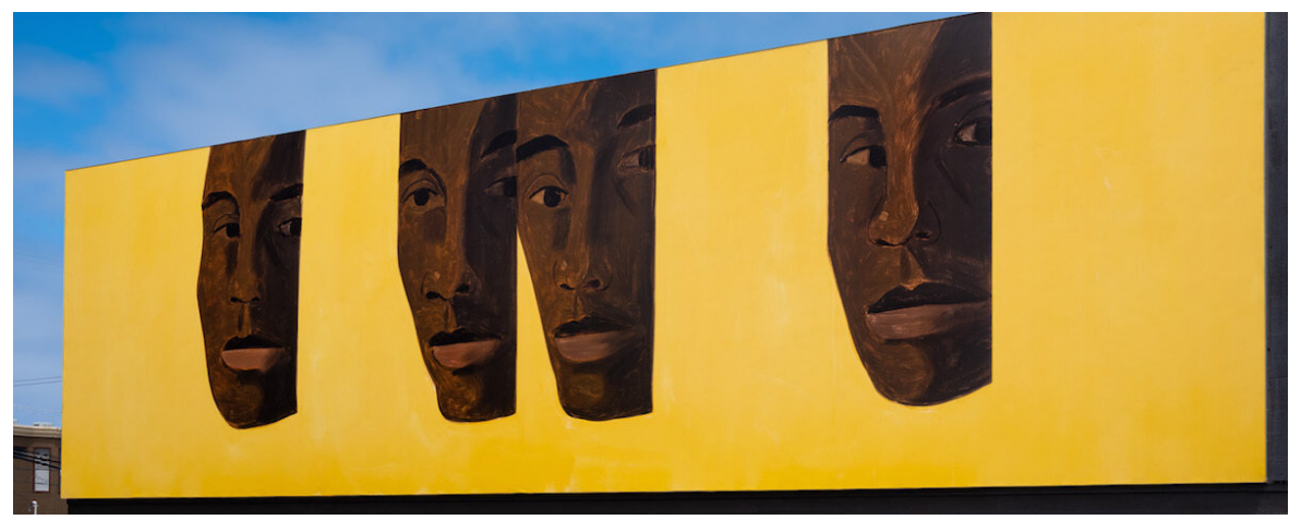
Alex Katz, Bill 2 (2019)